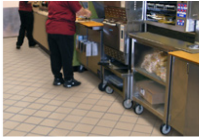
Metropolitan Ceramics shown above left in the floral department of a supermarket. Above right shows Metropolitan at work behind the counter at a convenience store. To the right are multiple colors of Down to Earth Tile in a produce section.