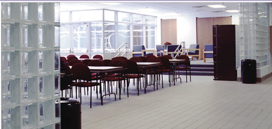
Metropolitan Ceramics shown above in a hallway and cafeteria setting. To the right, a kiln fired shade variation product works well for a locker room application. Areas like these - subject to spills and moisture - are perfect for Metropolitan.

Not all areas of a school are the same and no one floor covering will work everywhere. For hard working areas indoors and out, choose the hard working floor covering – Metropolitan Ceramics.