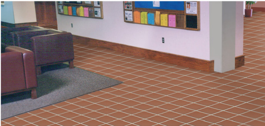
Photos above: Metropolitan Ceramics® Tile used in a community room. To the right Metropolitan's slip resisting characteristic works well in this waiting area.

If a slip resisting, durable, versatile, floor is required, consider Metropolitan Ceramics.