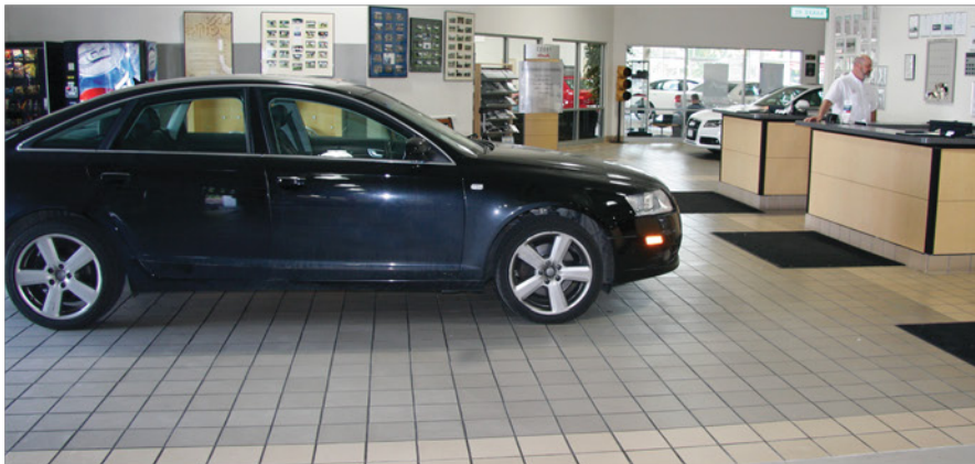
The photo above shows Metropolitan Ceramics tile used in a service entrance. The image to the right shows Metropolitan used in a car bay area.

There is one tile that meets all of these criteria and has an appealing look, natural slip resisting surface, and a variety of size and color options. That tile is Metropolitan Ceramics unglazed quarry tile.